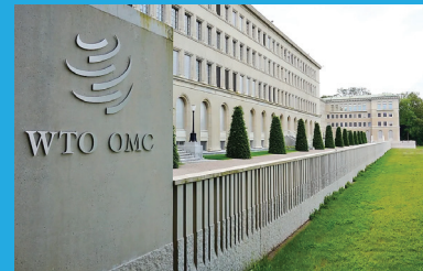
Centre William Rappard WTO HQ Geneva

*The specific details of locations are being firmed up with international organizations.