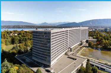
International Labour Organization HQ Geneva

Geneva's Diplomatic Hubs: Explore the iconic centers of international cooperation and diplomacy in Geneva, pivotal venues where global strategies and agreements are shaped.