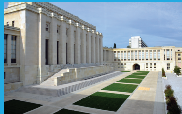
Palais des Nations, UNCTAD HQ Geneva